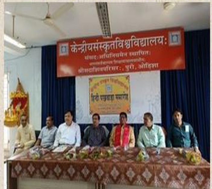
Hindi Pakhwada Samaroha organised by Modern Department, C SU, Puri For Year-2021-2022