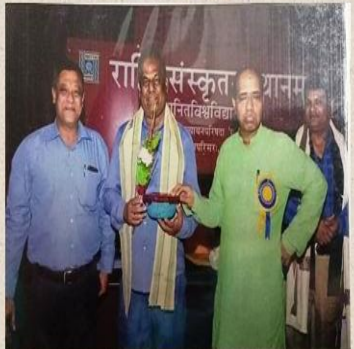
Hindi Pakhwada Samaroha organised by Modern Department, C SU, Puri For Year-2021-2022