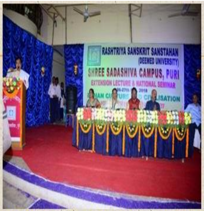
Extenssion Lecture Series & National Seminar organised by Modern Department, C SU, Puri