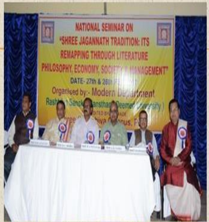
National Seminar on Shree Jagannath Tradition ; Its Remapping through Literature Philosophy, Economy society & Management organised by Modern Department, C SU, Puri