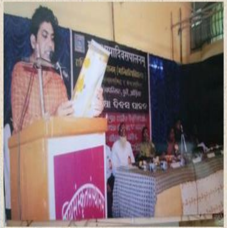
Matrubhasha Diwas organised by Modern Department, C SU, Puri