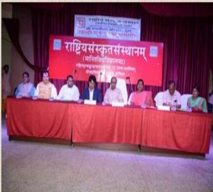
Hindi Pakhwada Samaroha organised by Modern Department, C SU, Puri For Year-2019-2020