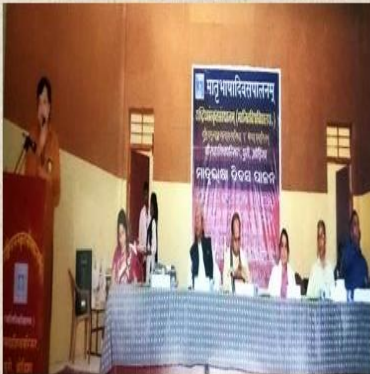
Matrubhasha Diwas organised by Modern Department, C SU, Puri For Year-2019-2020