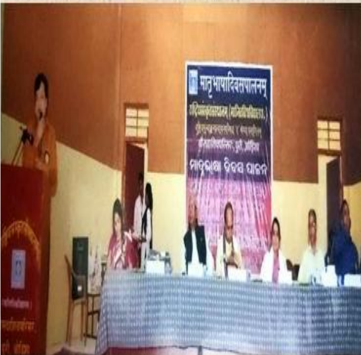
Matrubhasha Diwas organised by Modern Department, C SU, Puri For Year-2019-2020