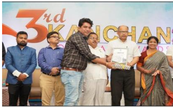
INTERNATIONAL SHREE JAGANNATH MAHOTSAVA, NEW DELHI on 11.12.2019. JAI JAGANNATH.