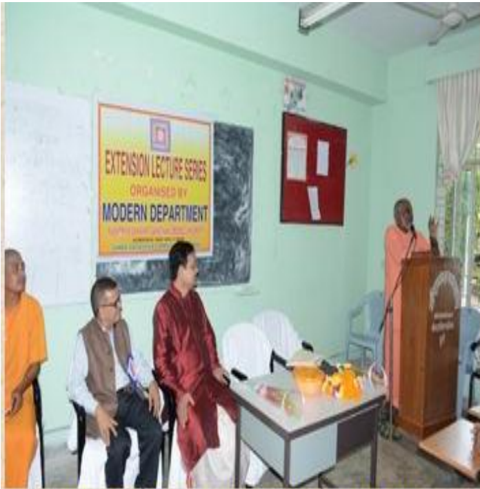
Extenssion Lecture Series organised by Modern Department, C SU, Puri