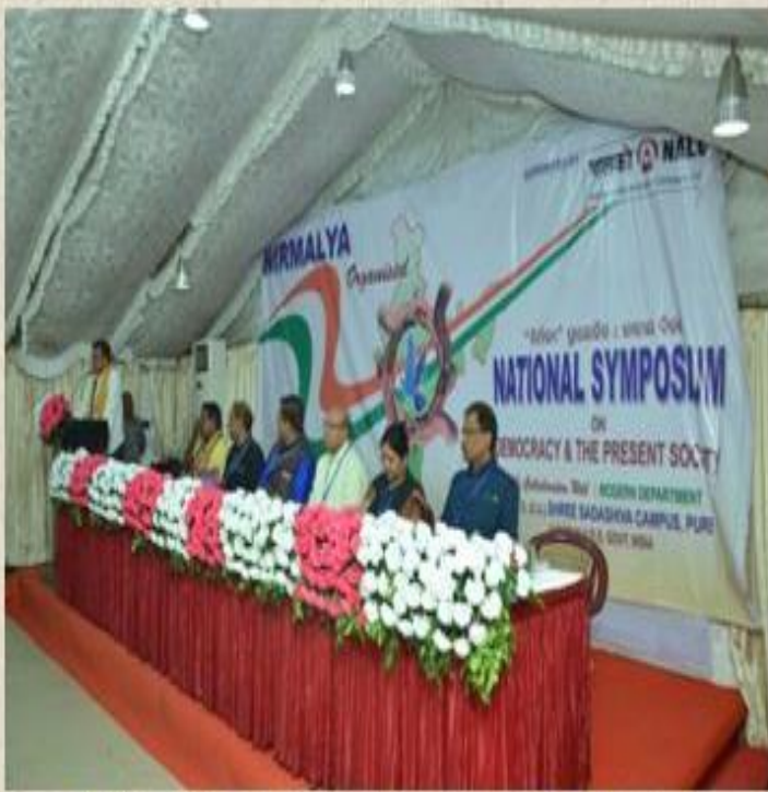
National Symposium on Democracy & the Present Society organised by Nirmalva and collaboration with Modern Department, C SU, Puri