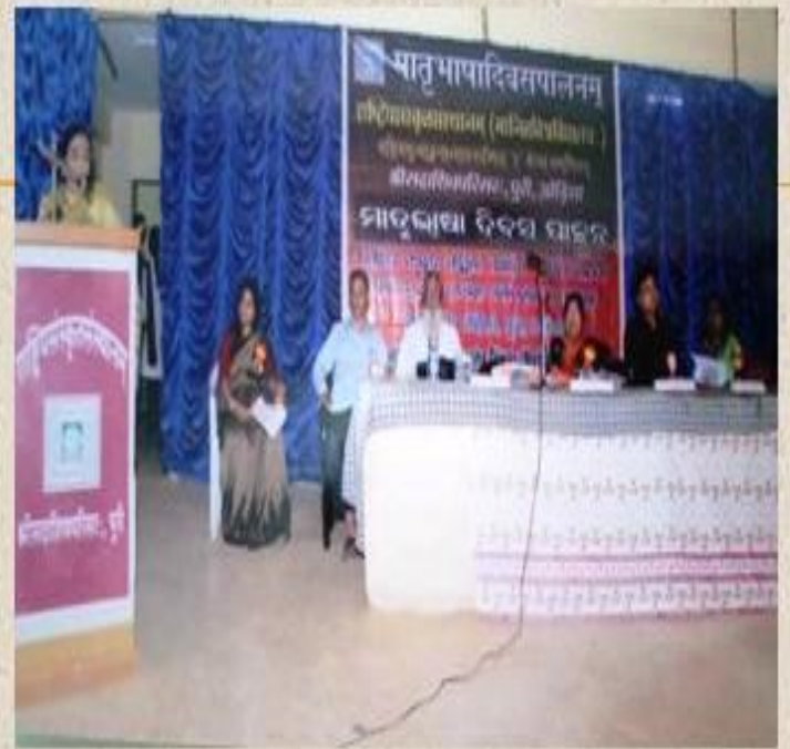
Matrubhasha Diwas organised by Modern Department, C SU, Puri For Year-2018-2019