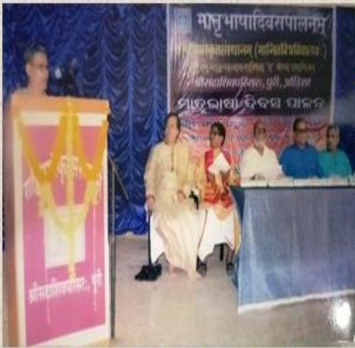
Matrubhasha Diwas organised by Modern Department, C SU, Puri For Year-2016-2017